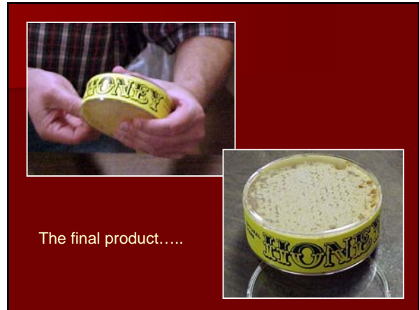
The final product....